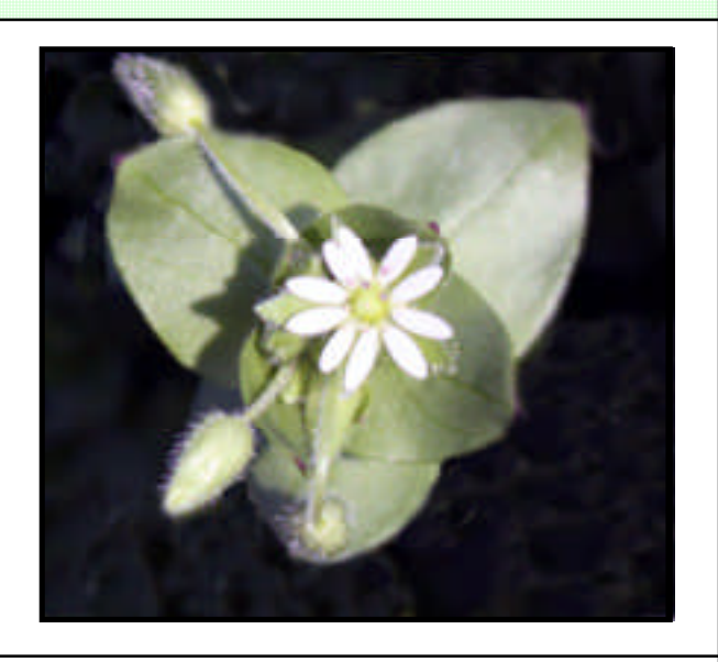
Stellaria media Common Chickweed