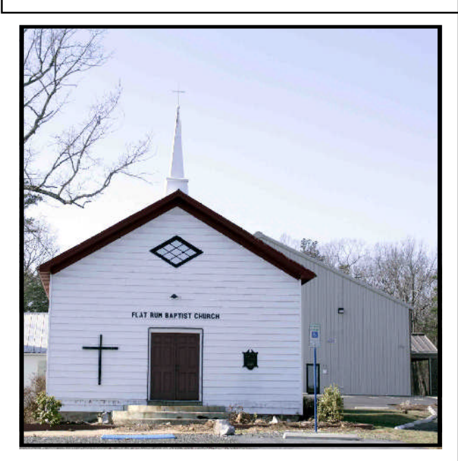
Flat Run Baptist Church Organized 1849